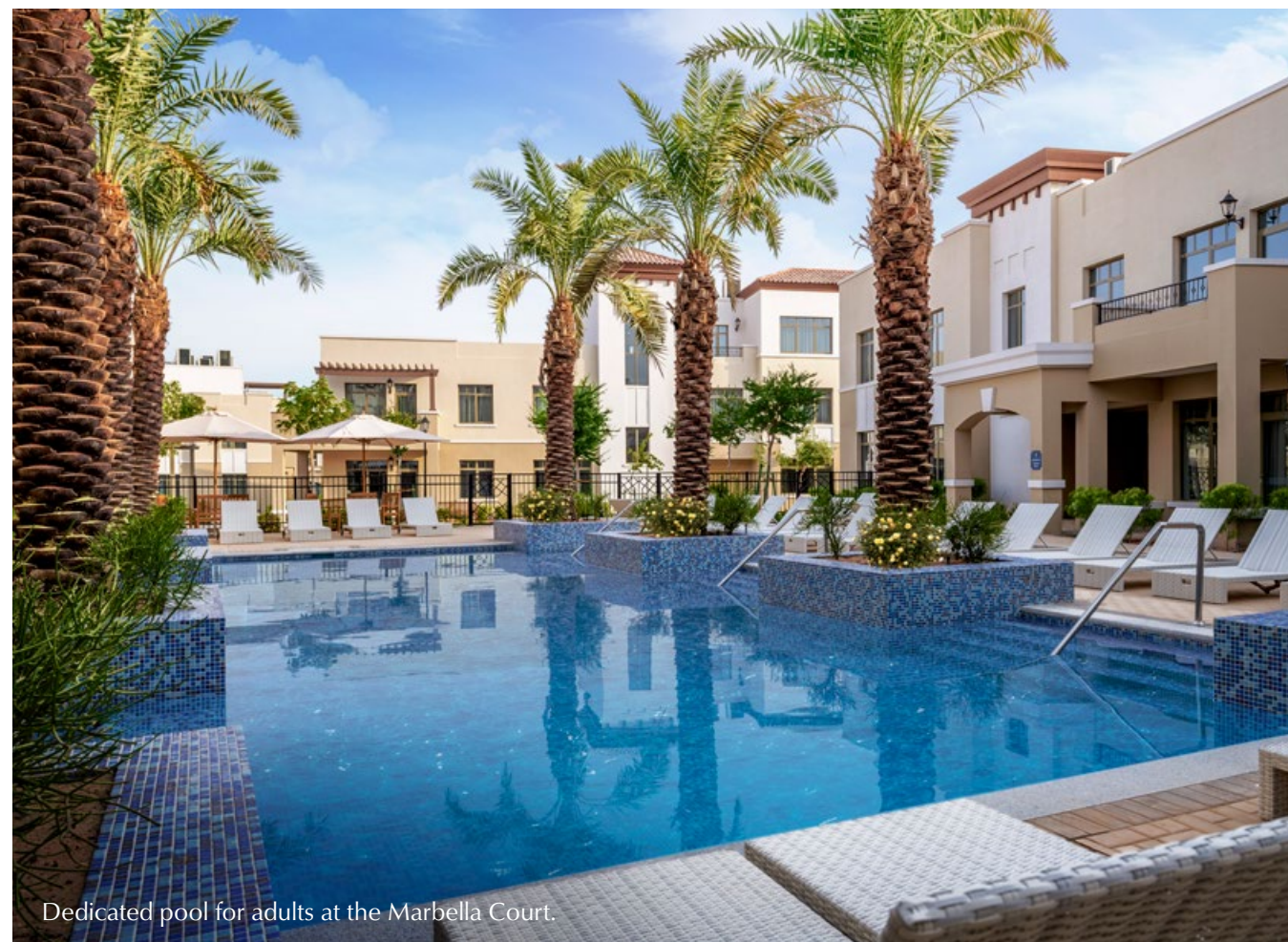
Dedicated pool for adults at the Marbella Court.